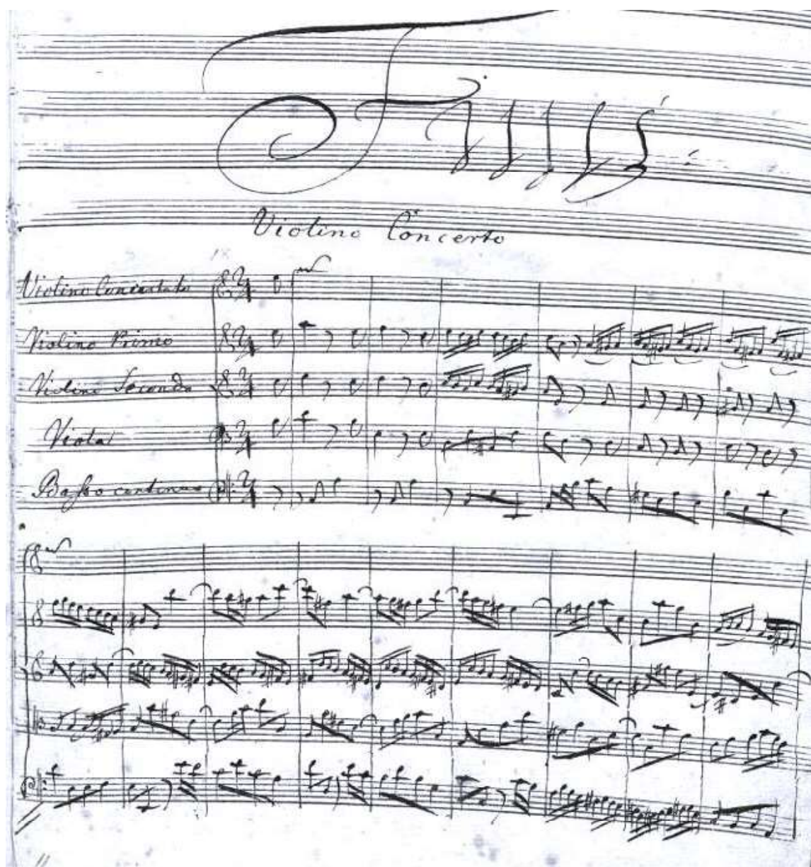
Violin Concerto in A minor, BWV 1041, Johann Sebastian Bach